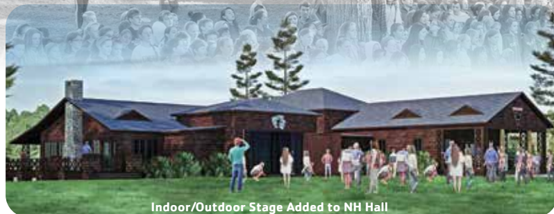
Indoor/Outdoor Stage Added to NH Hall