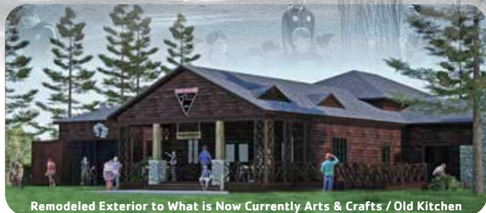
Remodeled Exterior to What is Now Currently Arts & Crafts / Old Kitchen