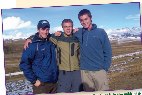
Three traveling friends in the wilds of Asia