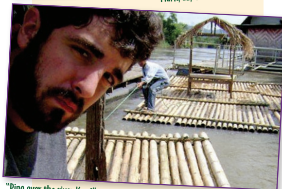
"Pino over the river Kwai"