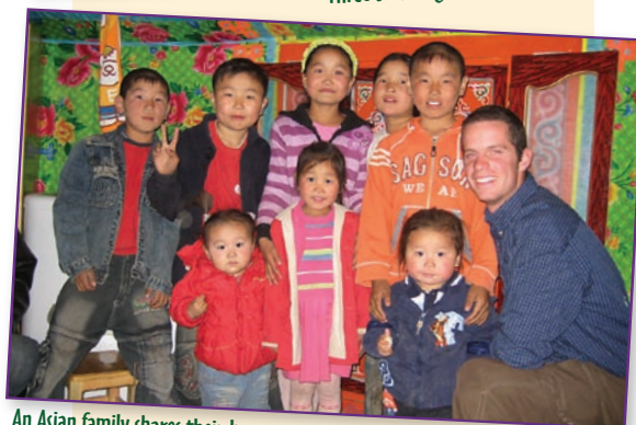
An Asian family shares their home