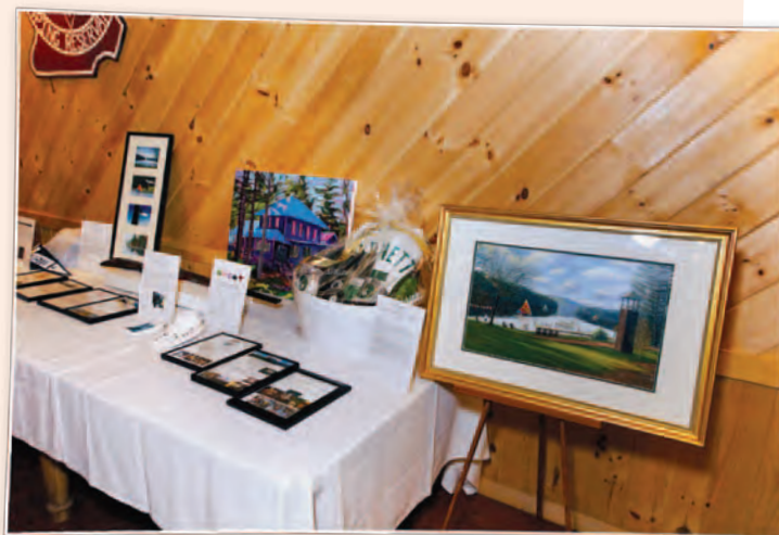
Live Auction item display including original artwork by alumni Emily Leonard Trenholm and alumni parent Cam Sinclair.