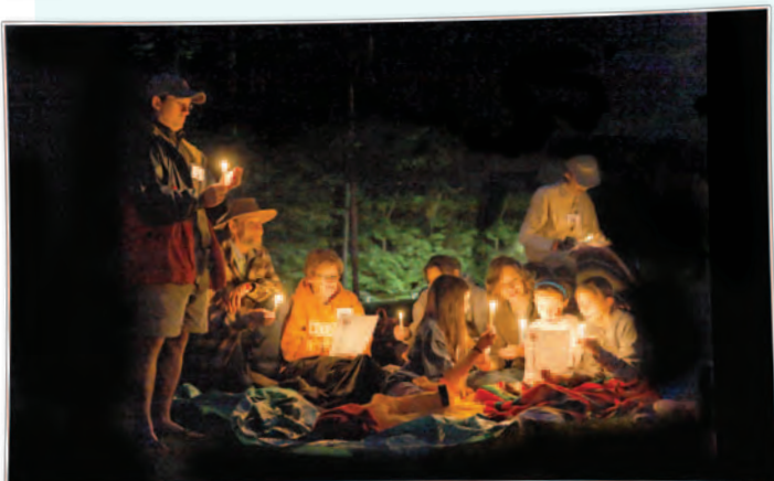
"It is better to light just one little candle than to stumble in the dark...."