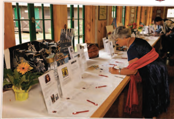
Silent Auction bidding in NH Hall during Cocktail Hour