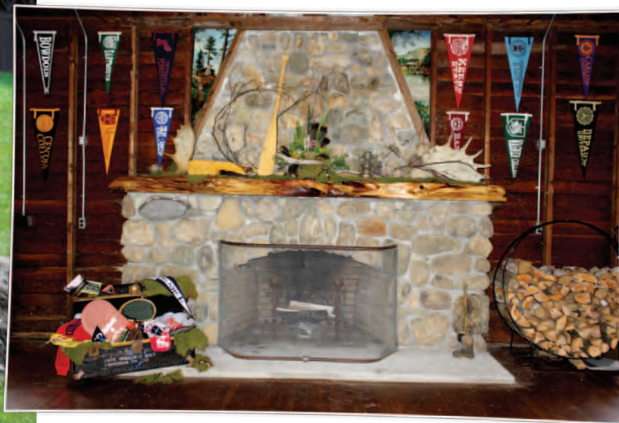
The Lodge fireplace all dressed up.