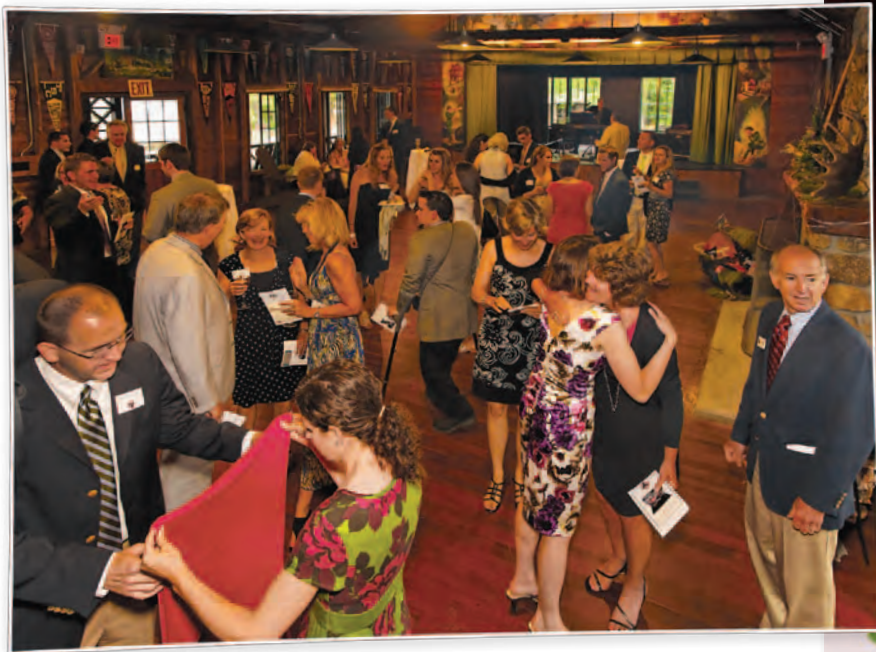
Gala attendees greet each other and enjoy cocktail hour in The Lodge