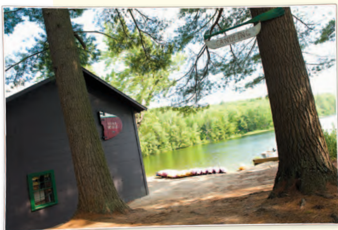
A view of the Boathouse.