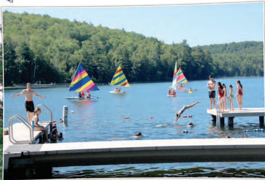
View of Lake Coniston from Girls Waterfront