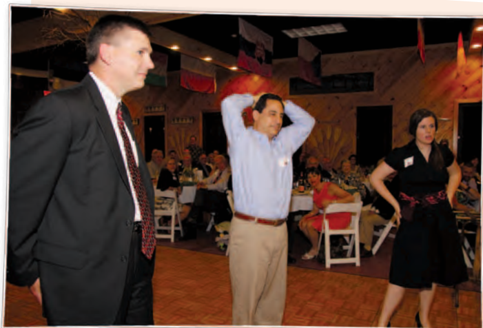
"Heads or Tails" finalists make their selection