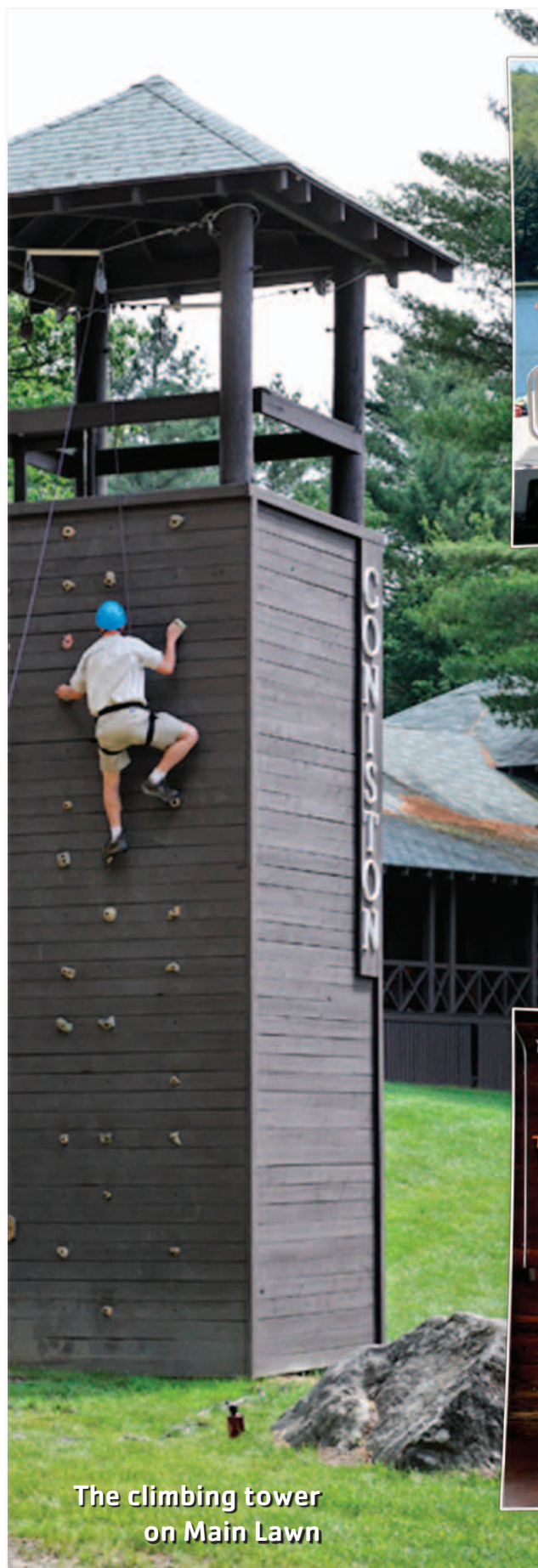
The climbing tower on Main Lawn