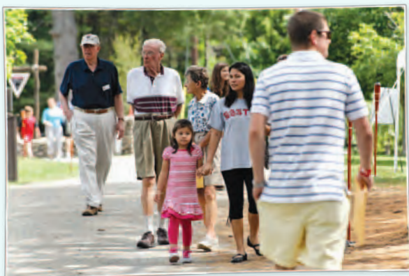
"Campers" of all ages make their way down Main Camp Road for the days activities.