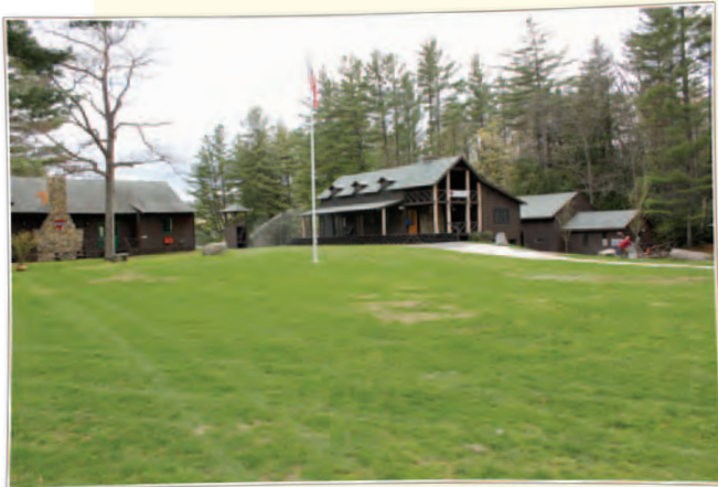
Main Office, and view of Center Lawn