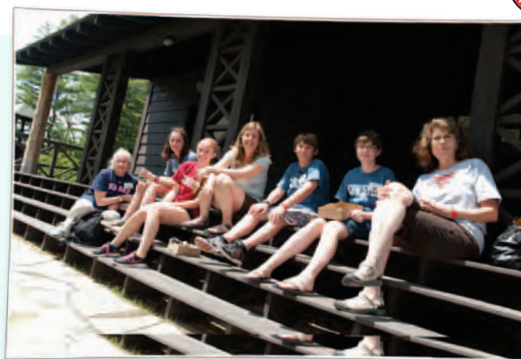
Coniston Family and Friends enjoying lunch on the Main Office Porch