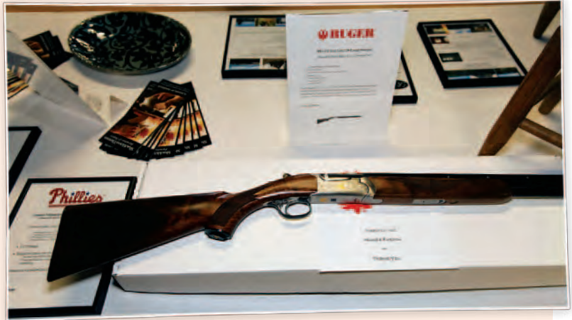
One of a kind Coniston Centennial Ruger Red Label 28 Gauge Shot Gun donated by Sturm, Ruger & Co of Newport, NH