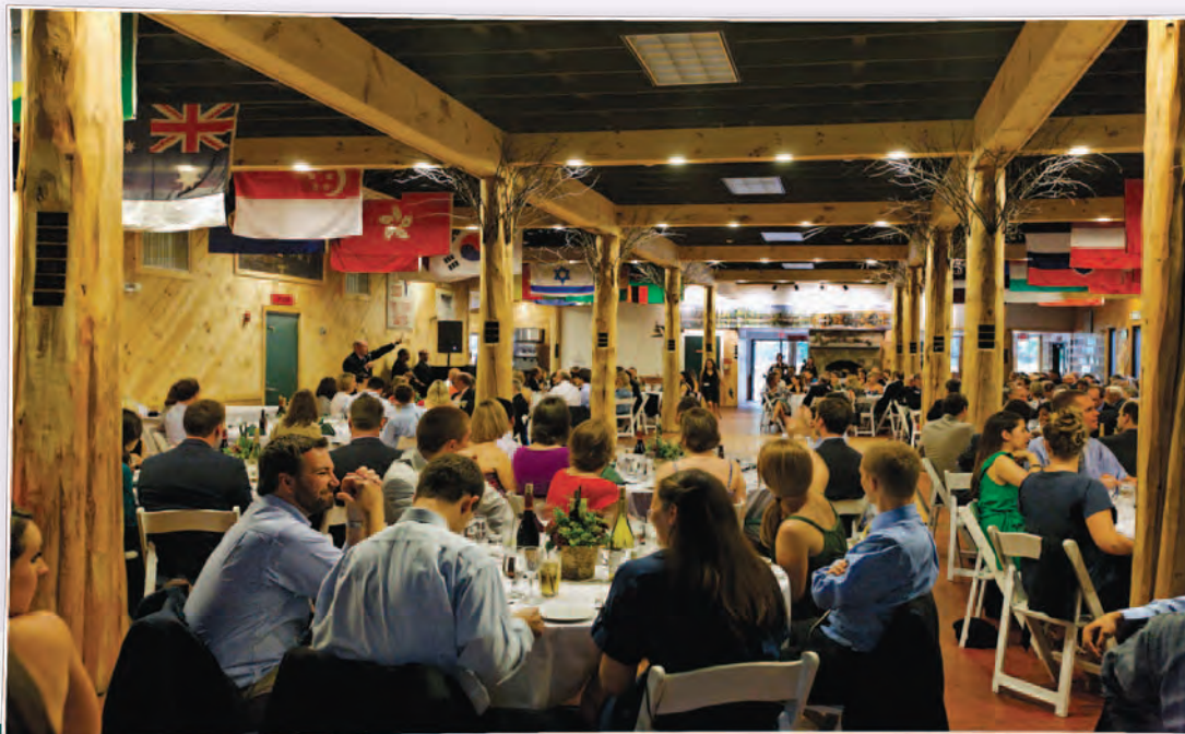
View of the Dining Hall during the Gala Dinner