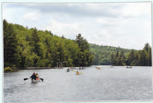
The boats were in full use on such a gorgeous Lake Coniston Day