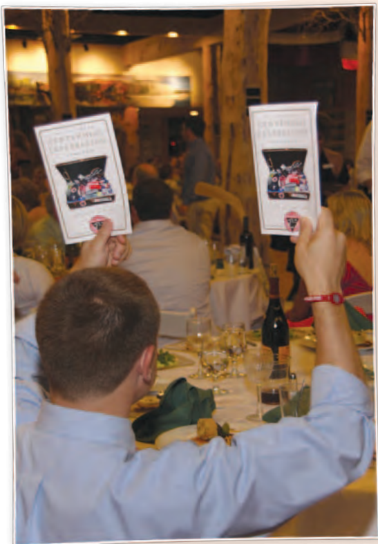
Not one but two bid books raised to donate $100 for donations to the Coniston Campership Fund!