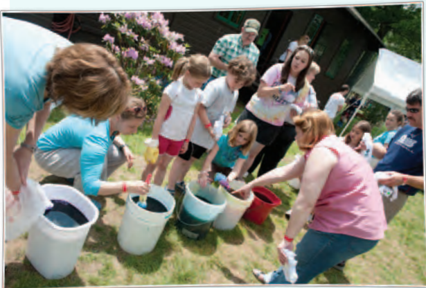
A timeless camp activity enjoyed by all: Tie Dye!