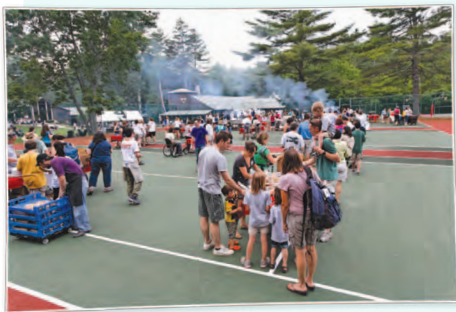
Cookout Dinner "served" on the tennis courts! Coniston and FitzVogt Dining Staff were absolutely fantastic in feeding over 2000 attendees for both lunch and dinner.