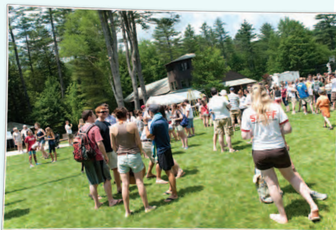
The crowd on Center Lawn during the afternoon