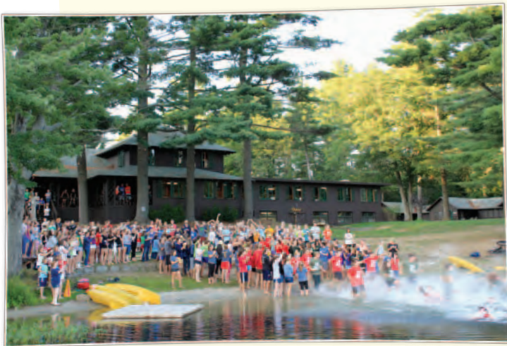
CITs still return in front of the Old Dining Hall— now known as New Hampshire Hall.