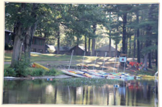
Family Beach, now Sailing Beach.