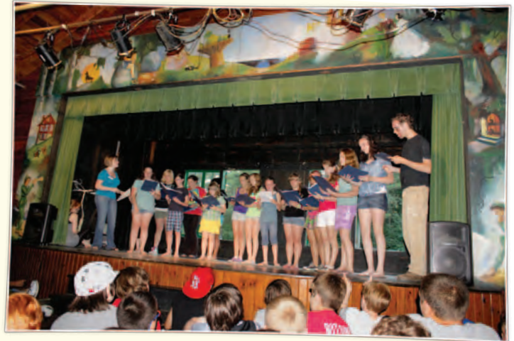
Coniston singers perform on the Lodge stage