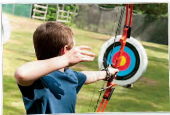
Classic Camp: Archery!