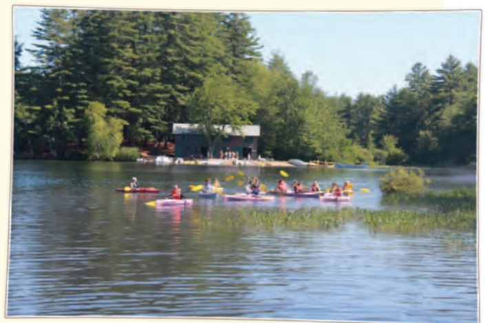
Lots of activity on the lake.