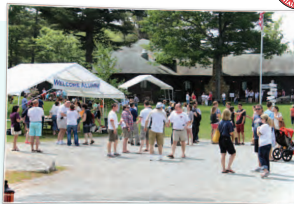
Friends gathering in Main Camp