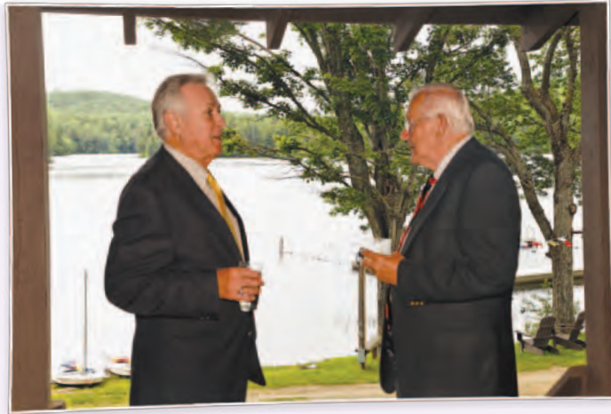
Grandparents and local community members enjoyed cocktail hour overlooking Lake Coniston