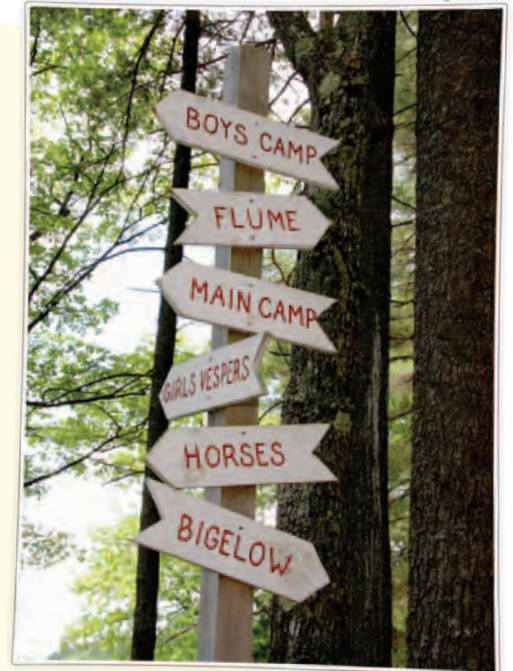
One of many Camp signs