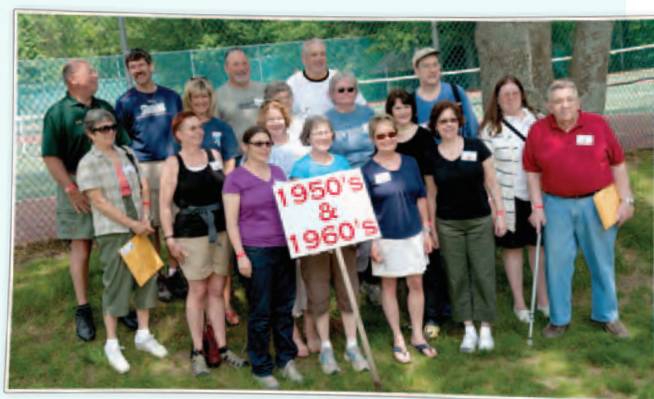
Some of the alumni in attendance from the 1950's and 1960's pose for a group shot.