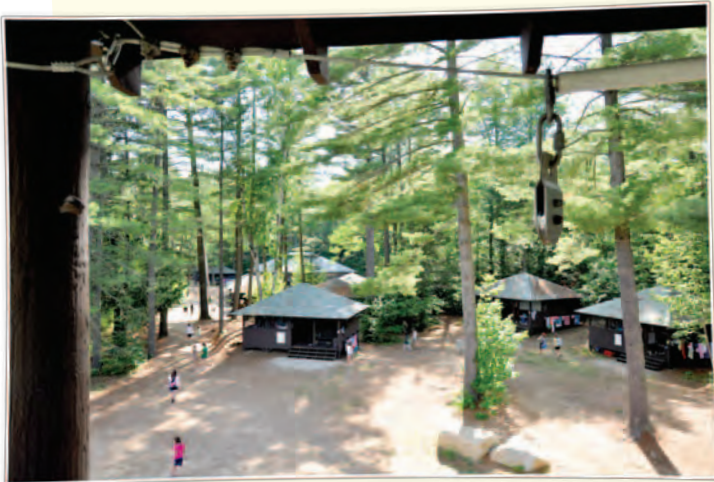
A birds-eye view into Girls Camp