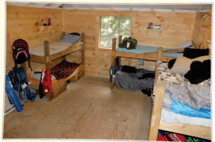
Boys cabin, cleaned and ready for inspection