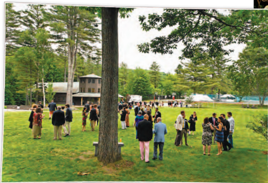
Gala Attendee arrival on Center Lawn