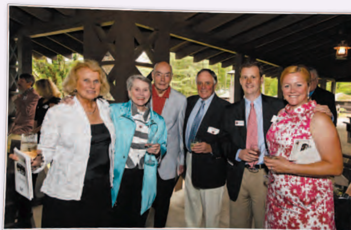
Board members and friends pose for a group shot