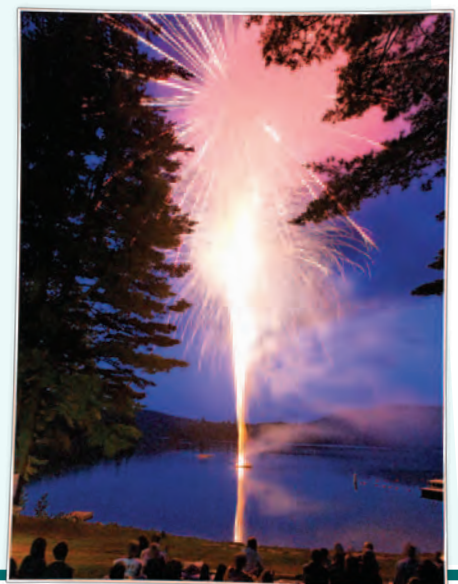
Fireworks over Lake Coniston to close out a perfect camp day.