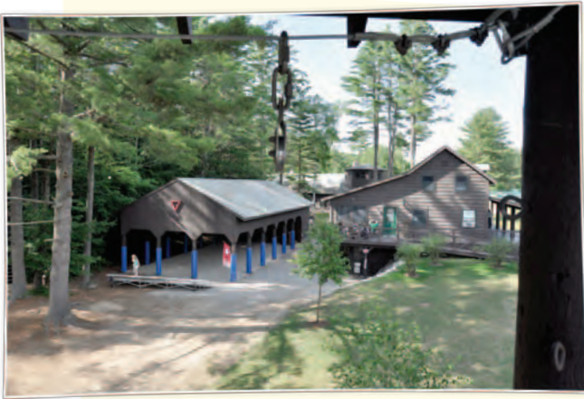
The Pavilion (site of the Ice Cream Social aka ICS, Gymnastics and Talent Show), with the Dining Hall in the distance.