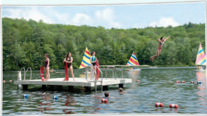
It was a picture perfect day for swimming and boating on Lake Coniston.