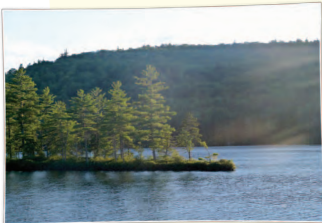
Peninsula of Boys Cabin and Pennyroyal as seen from Gazebo — some things never change!