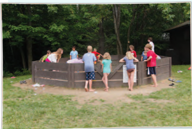
GAGA is a newer game to Coniston that current campers can't get enough of!