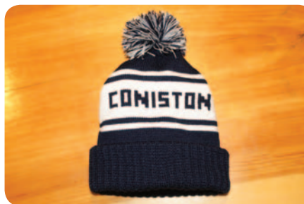
T-shirts, sweatshirts, hoodies ... and our new winter hat!!